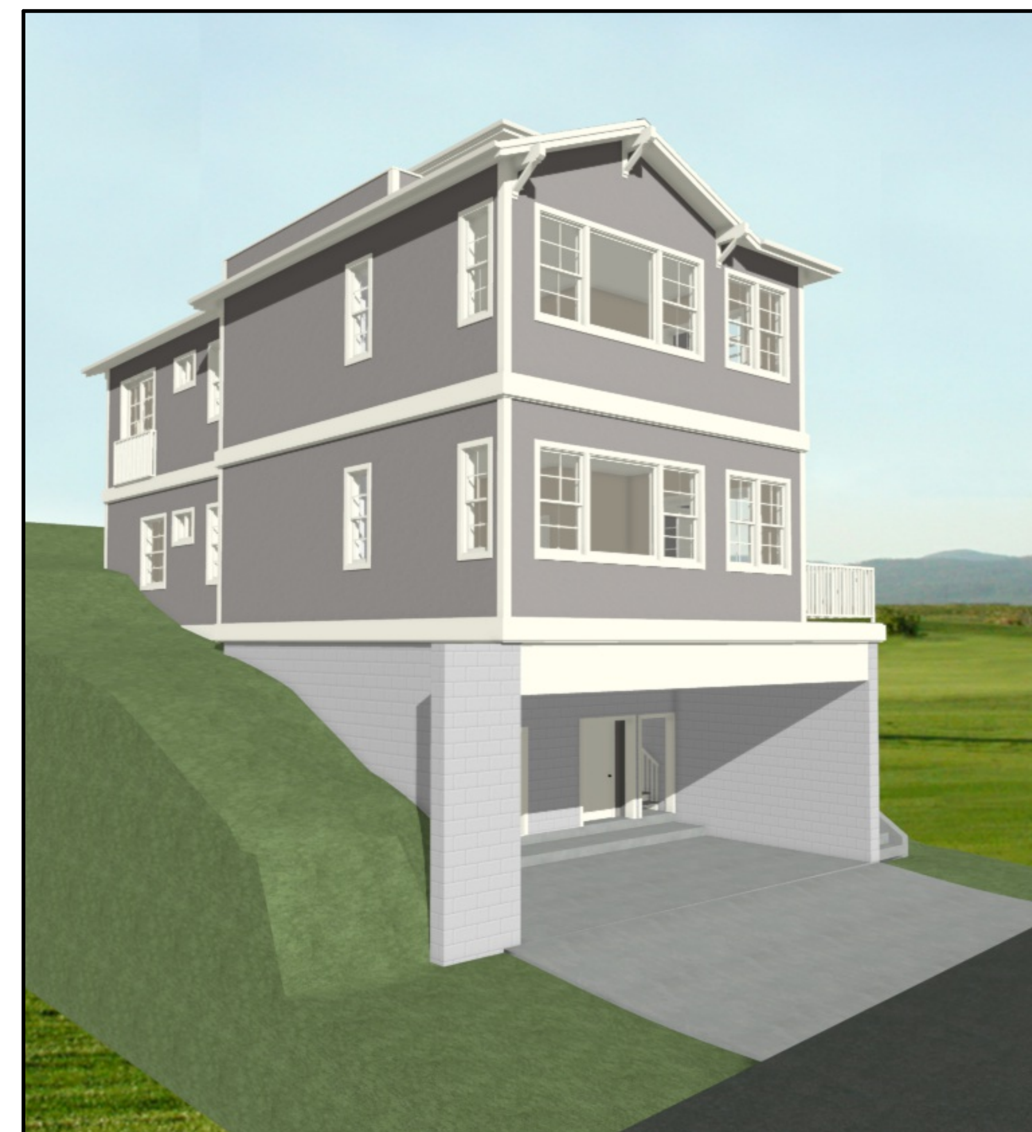
NORTHEAST VIEW 3-D RENDERING (FROM ALLEY)