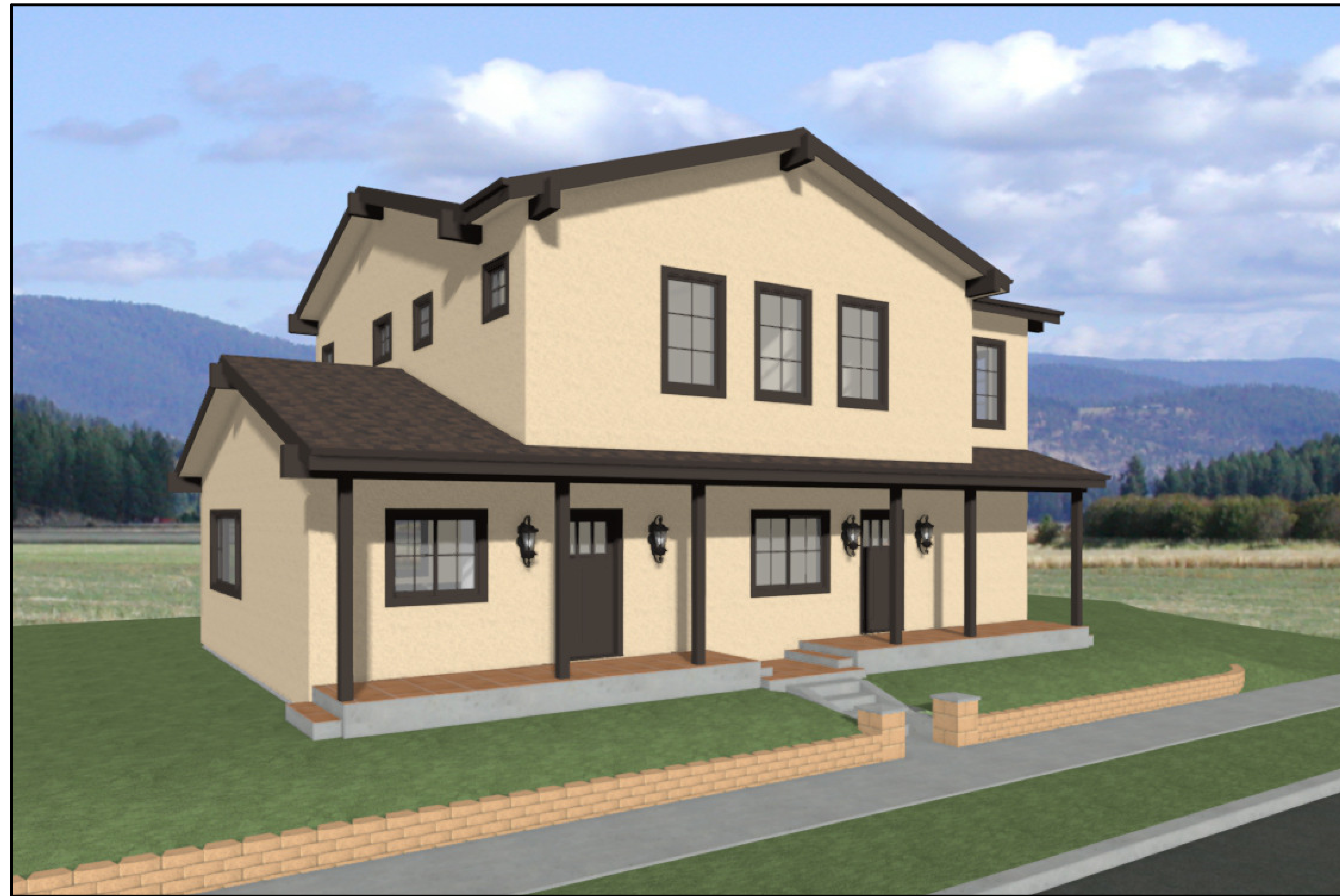
FRONT VIEW 3-D RENDERING