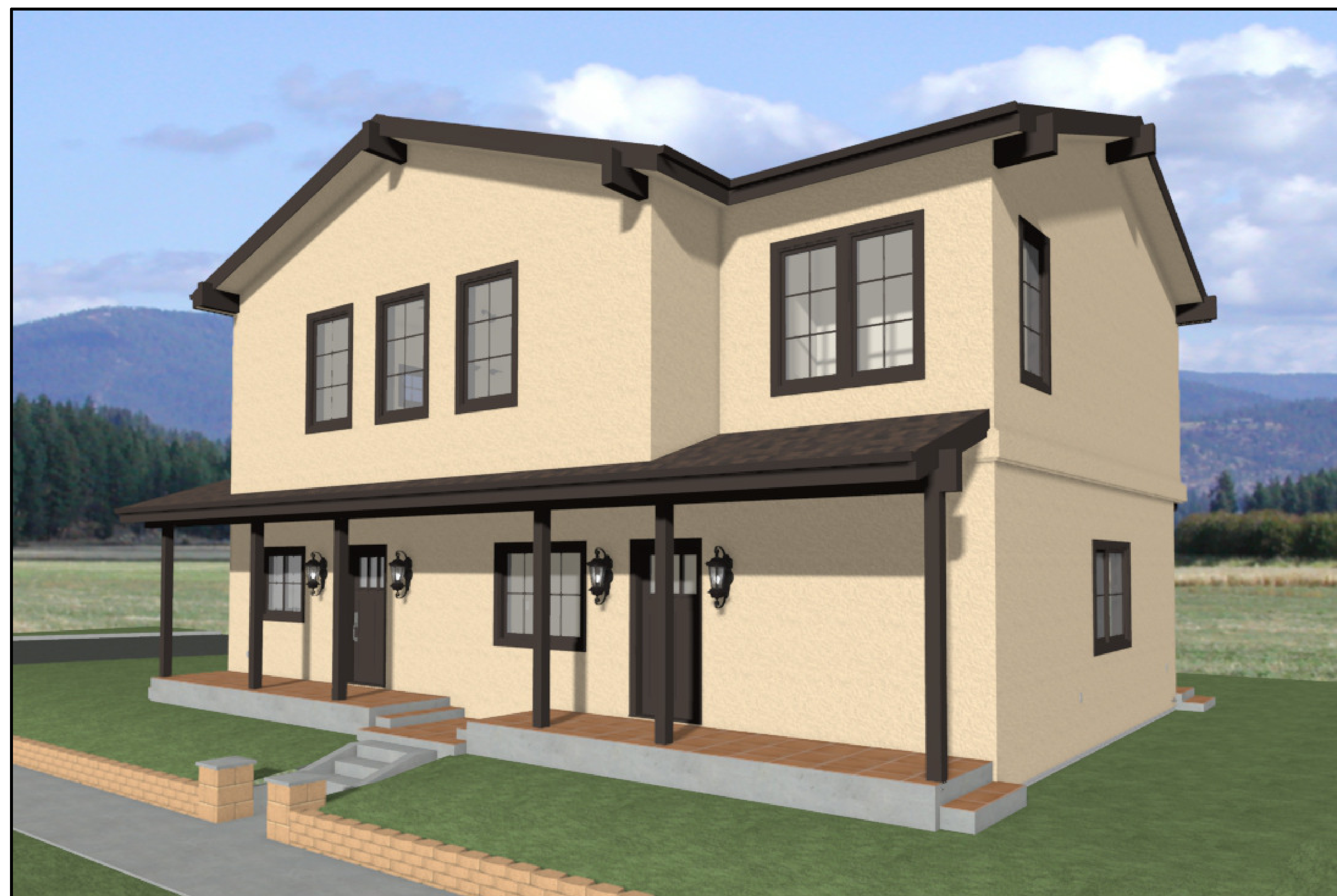
FRONT VIEW 3-D RENDERING