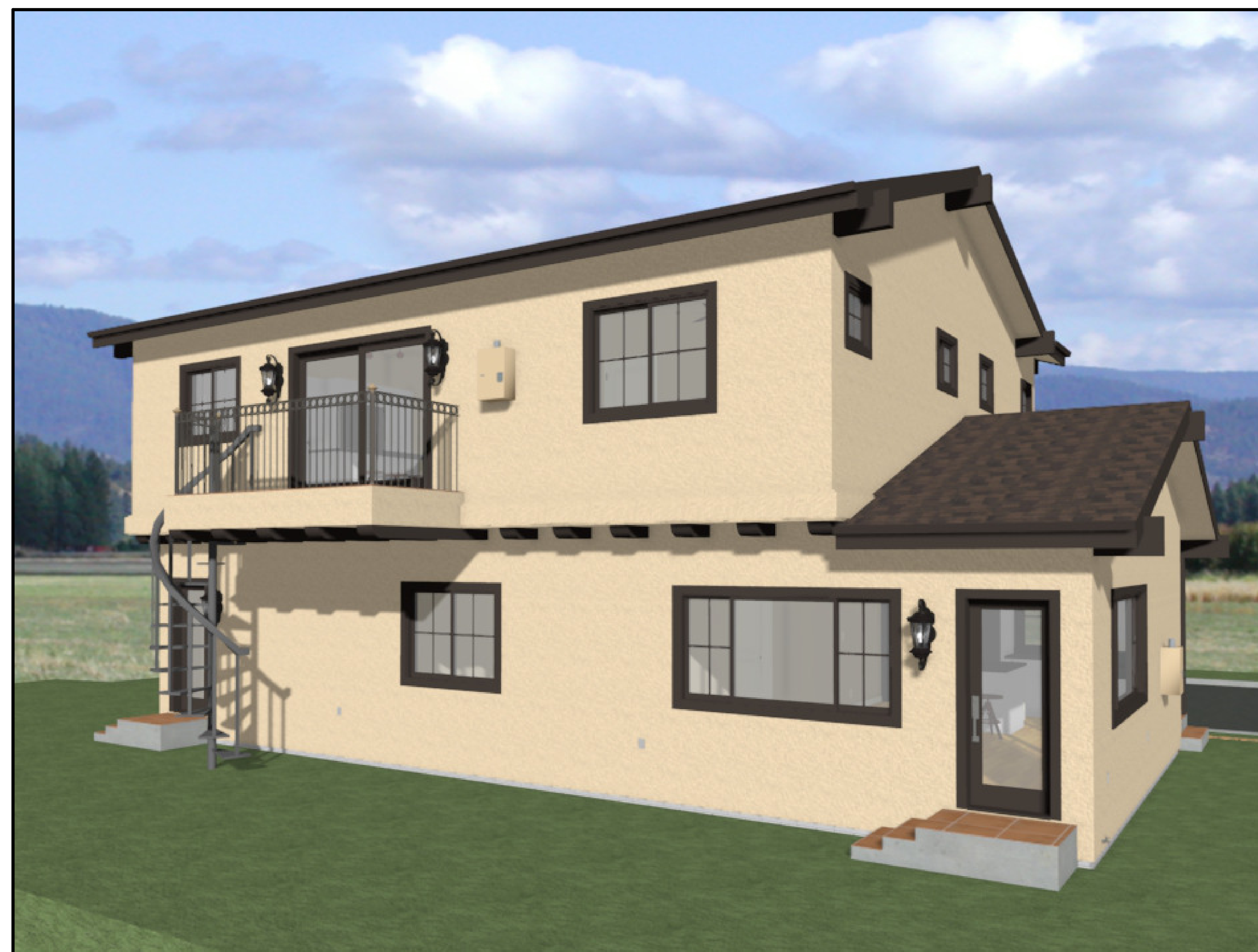
REAR VIEW 3-D RENDERING