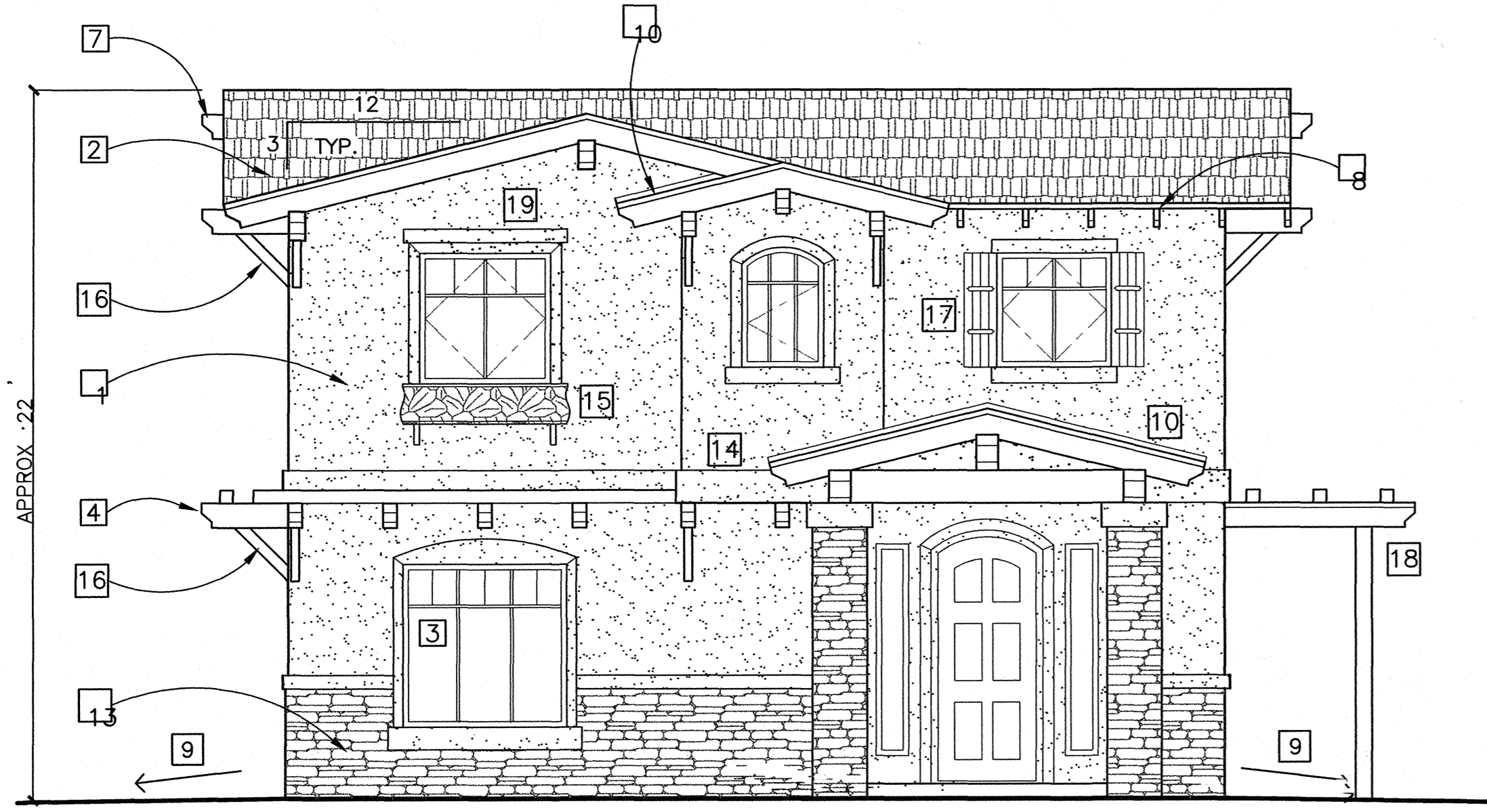
WEST ELEVATION 1/4" = 1'-0"