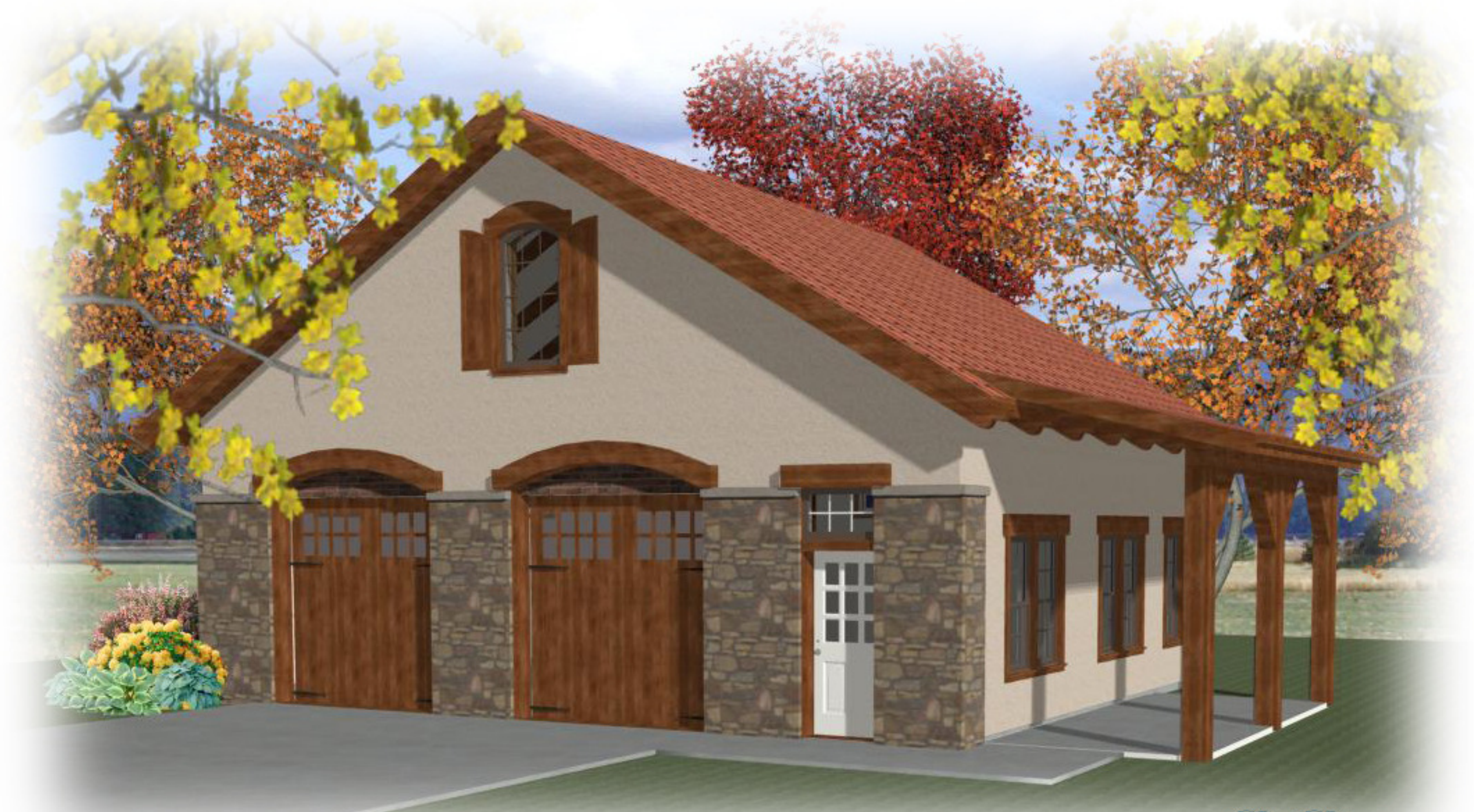
GUEST HOUSE PERSPECTIVE