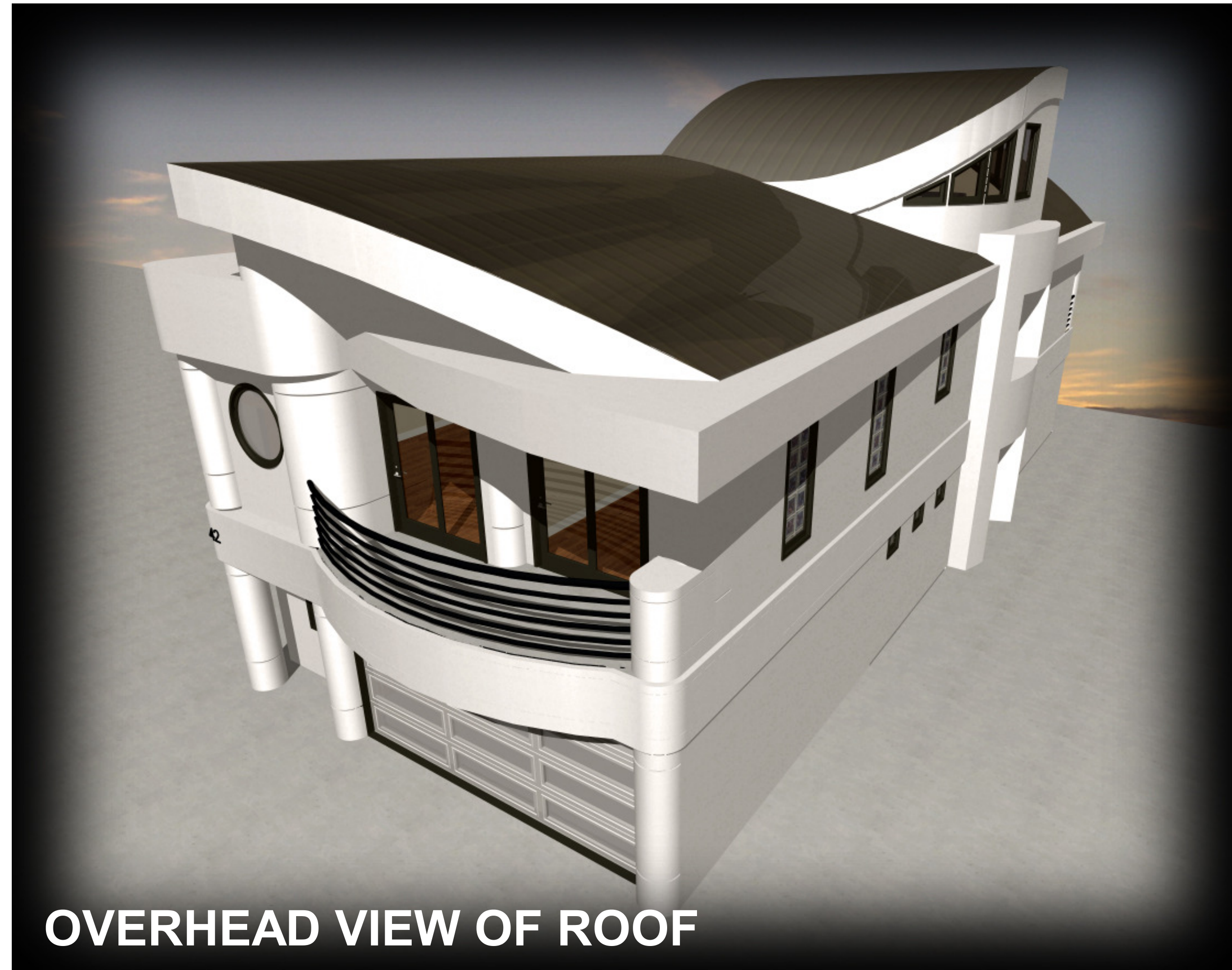
OVERHEAD VIEW OF ROOF