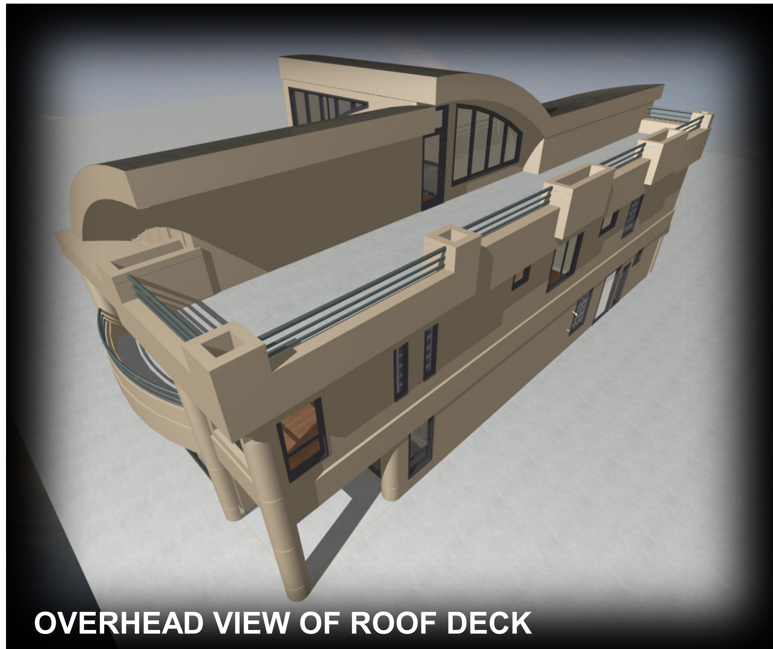
OVERHEAD VIEW OF ROOF DECK