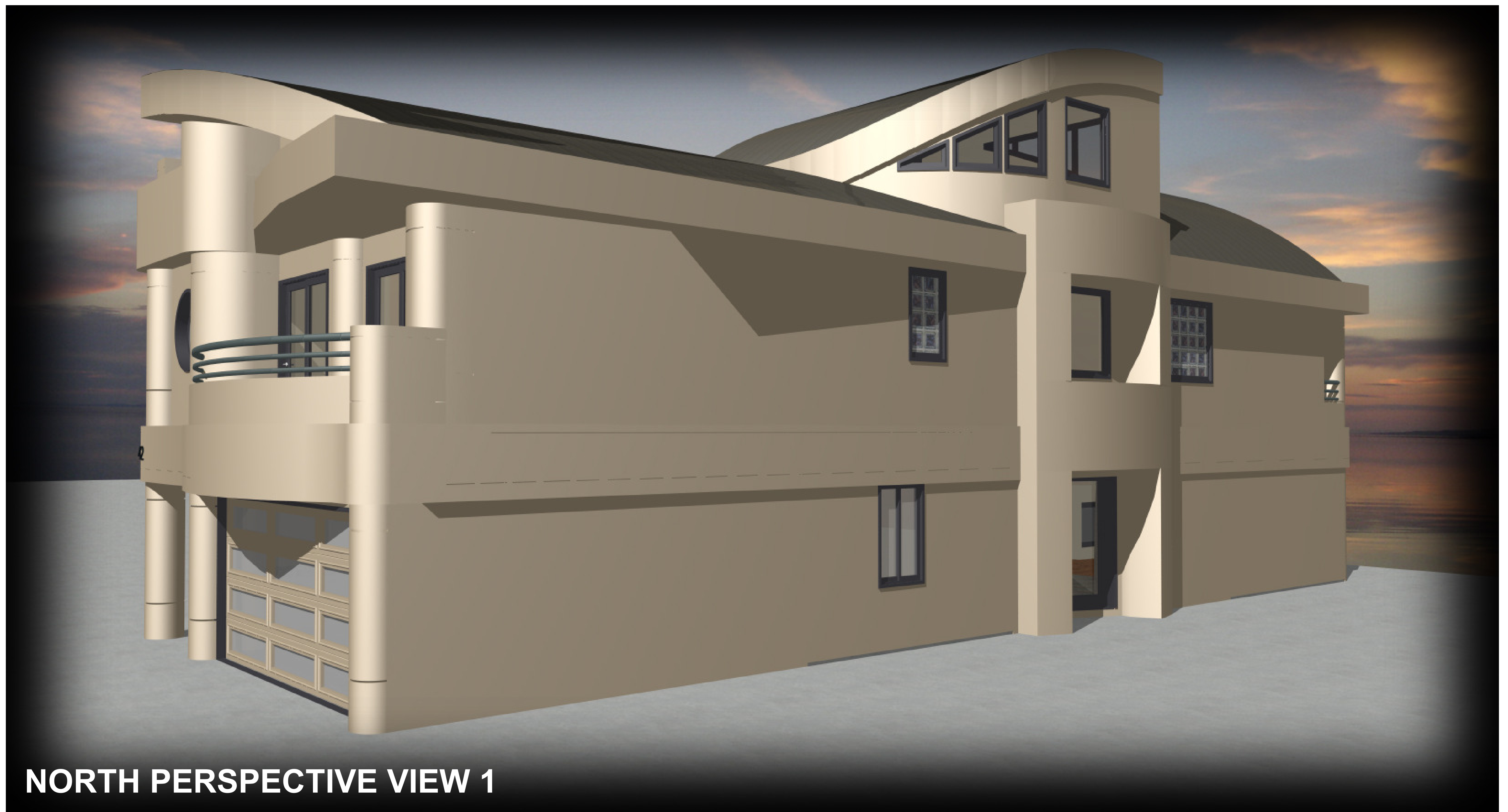
NORTH PERSPECTIVE VIEW 1