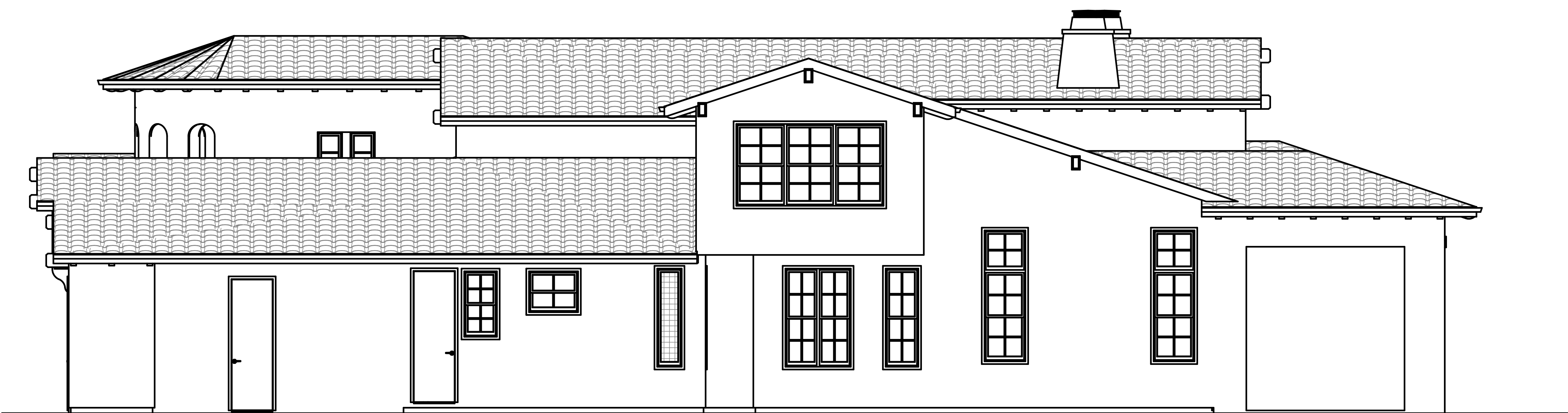
RIGHT SIDE ELEVATION SCALE: 1/4" = 1'-0"

BOLAND INDOOR / OUTDOOR ROOM ADDITIONS 1345 SHOREBIRD LANE, CARLSBAD A.P.N.: 215-791-17